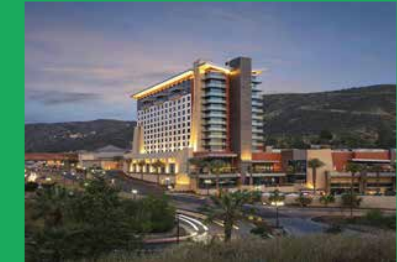
Sycuan Hotel & Casino - Proud Sponsor